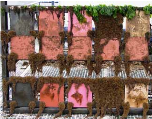
Transocean executes raft testing of antifouling worldwide.

High pressure – and Ultra high pressure water jetting is therefore the preferred method for maintenance shipyards as it not only results in less waste but also it leaves a good clean substrate for recoating.